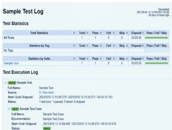
Figure 3: Sample test log and test execution log